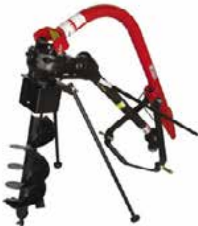
MODEL 300 DIGGER FOR SUB-COMPACT TRACTORS