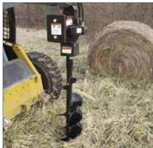
924HC SKID STEER MOUNTED HYDRAULIC POST HOLE DIGGER