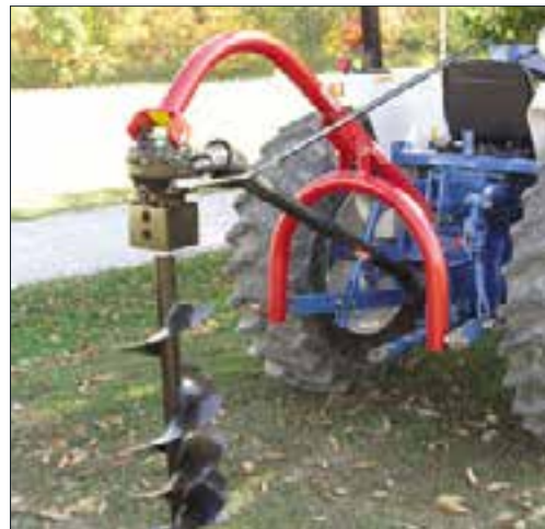
MODEL 500 STANDARD DUTY POST HOLE DIGGER

924HC Skid Steer Mounted Hydraulic Post Hole Digger