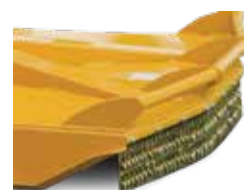
Chain Curtain Option