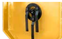
Pulsar Blade Assembly