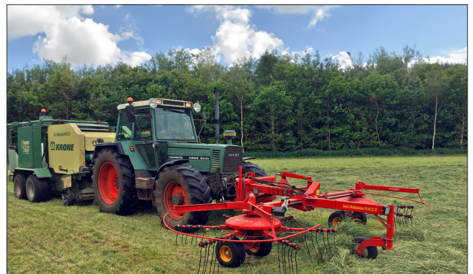
TI-6000FL ROTARY RAKE