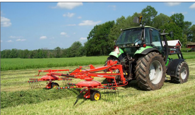
TI-6000 ROTARY RAKE