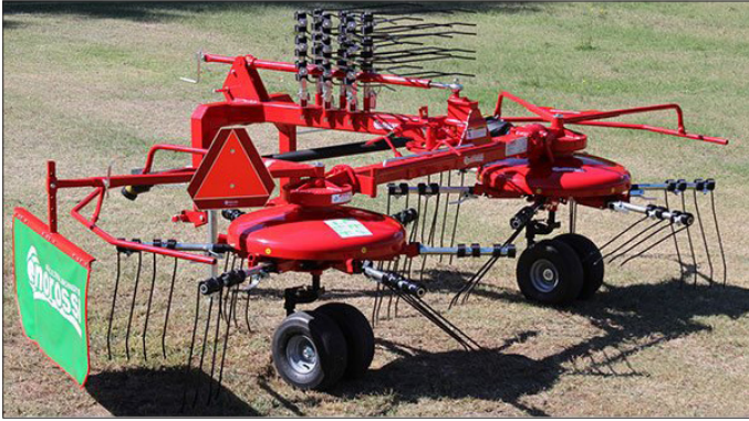
DR420 ROTARY TEDDER RAKE