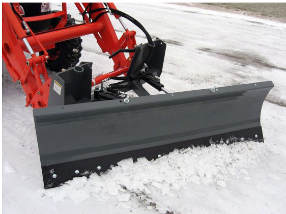
FRONT-LOADER SNOW BLADE