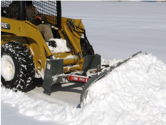
SKID STEER SNOW BLADE