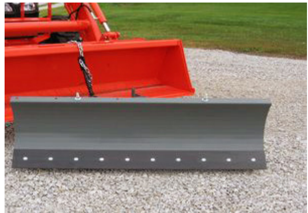
CLAMP-ON SNOW BLADE