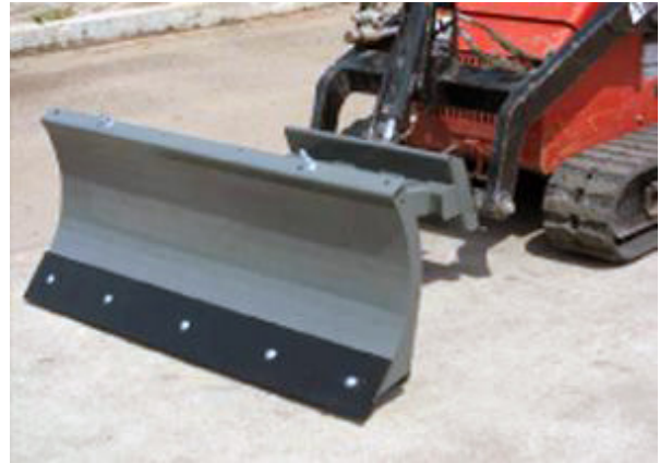
MINI SKID STEER SNOW BLADE