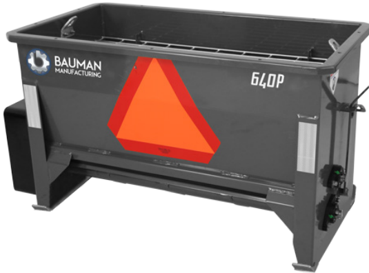
640 DROP SPREADER