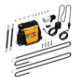
Hydraulic Gate Kit PN 230220