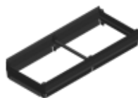
Hopper Extension PN 170095