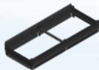
Hopper Extension PN 170095