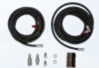
Front-End Loader Hose Kit PN 196056