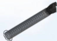
Funnel w/ 6" Hose Adapter PN 170110