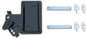
Tilt Bracket Assembly PN 21301

Bolt-on/weld-on bracket that mounts to a flat surface