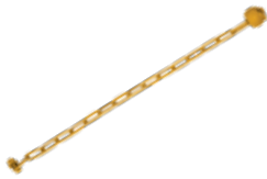
Plumb Bob PN 21356

Provides vertical line reference for operator