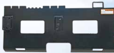
SKID-STEER OFFSET Quick Attach Mount PN 21355

Equipped with offset mounting for front-end loaders