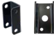
Extra Mount Bracket PN 21302

Provides vertical line reference for operator