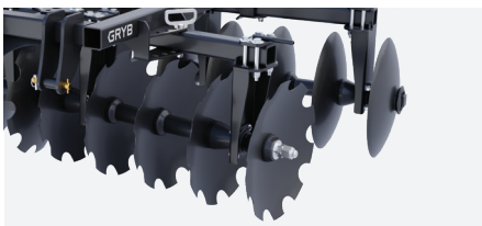
Notched or smooth disk blades for a variety of conditions.

Heavy-Duty Construction – Reinforced steel frames and Category 1 & 2 hitch compatibility ensure long-term durability and tractor versatility.