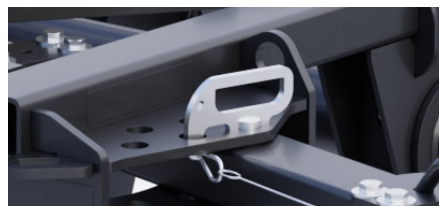
Tool free gang angle adjustment.