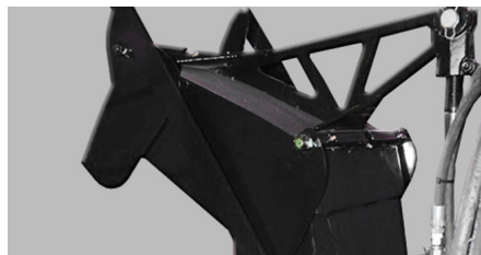
New re-designed chute