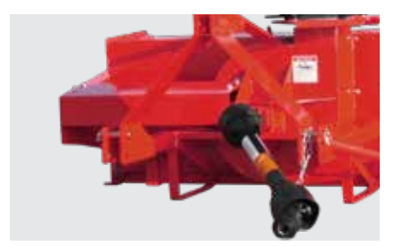
3PH / Quick Attach

All single auger PTO driven models are built for Category 1 or Category 2 type 3PH. Dual auger PTO driven models are built for Category 2 or Category 3 type 3PH. All models are Quick Attach compatible.