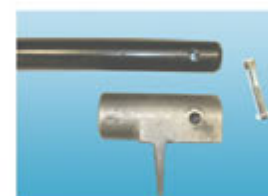
Spear Kit — Bolt-In #832815