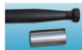
Spear Kit Conus II Tapered #831119