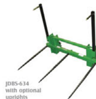
JDBS-634 with optional uprights