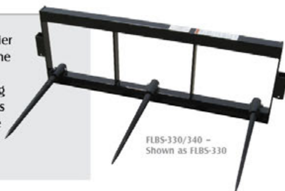
FLBS-330/340 – Shown as FLBS-330

Handling large or mid-size rectangular bales is easier using one of our 3 or 4 spear models to perform the job. All models feature tapered "forged" spring steel spears. Optional pin-on brackets or interfacing brackets for most popular quick-attach front loaders are available. Select models are convertible for use on a 3-pt. hitch with the addition of the optional bolt-on ear assembly (not Quick Hitch adaptable).