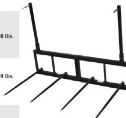
FLBS-449/432 – Shown as FLBS-449 with optional uprights