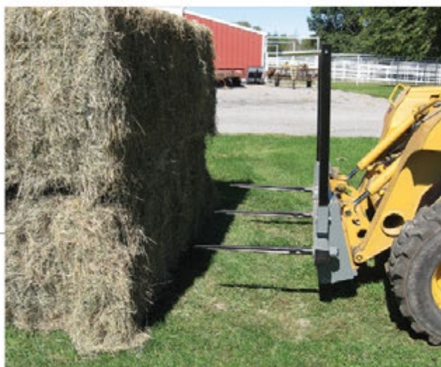
SSRB-330 with optional uprights

Designed for skid steer and tractor front loaders that use the industry standard "universal quick-attach" system. Patented design allows easy access to the skid steer seat with its step through feature. Models are offered for round bales as well as square bales. Forged tapered bolt-in spears allow easy spear penetration of the bale.