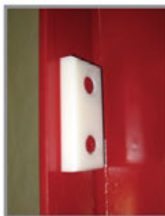
UHMW Polyethylene Slide Blocks — Used on all HPD-22Q/26Q drivers provide longer service life.