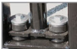
Cushion Mount — Cushion mounts on Q-series drivers reduce spring vibration and driving ram shock resulting in increased reliability.