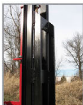
Reinforced Rails — Carriage reinforcement braces reduce carriage whip and insures durability of the driver.