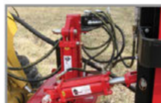
Hydraulic Adjustable Mount — Hydraulic Adjustable mount with 3" x 6" cylinders provides superior ram control with trouble-free performance.