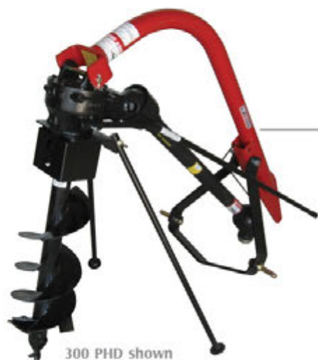
300 PHD shown with optional Parking Stand Kit

Engineered to allow the operator to dig deeper, faster and smarter, Worksaver's complete line of PTO powered diggers offer time saving convenience with outstanding reliability. Shear-bolt protected driveline is coupled to a rugged gearbox featuring tapered roller bearings and spring-loaded seals for extended service life. Large 2" output shaft has two-bolt auger connection for reliable power transfer. All job matched augers utilize fishtail center points with double flighting on the first turn for quick, positive digging action right from the start.