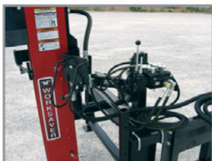
Convenient control location