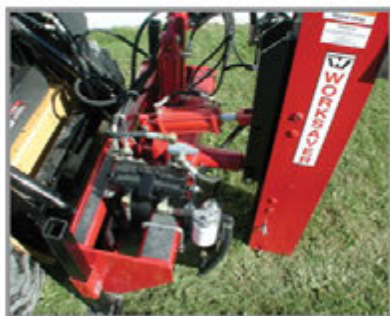
Self-Contained Unit — Overhead view of compact design (required for select models of skid steers, available for all size drivers)