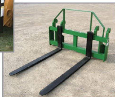
John Deere Integrated Frame Pallet Forks