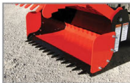
Optional bolt-in bottom of 10-gauge steel item #812265 is available. (Side plates shown installed)